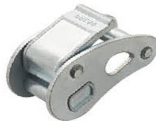
1.5" Cam Buckle