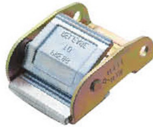
2" Cam Buckle